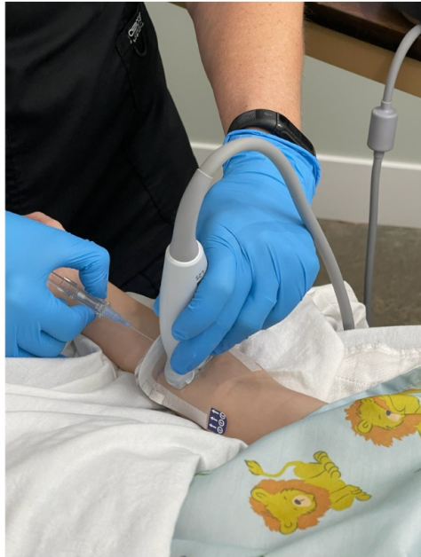
An ultrasound-guided peripheral IV (UGPIV) procedure using a sterile barrier and securement dressing that separates the ultrasound gel and transducer from the sterile insertion site

In her upcoming session, Moureau will describe the principles and practice of Aseptic Non-Touch Technique (ANTT) , a fast, safe, and cost-effective process that has been widely adopted across Europe to promote safety during medical and surgical procedures.